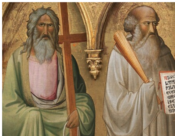
fig. 2 Detail of Saint Andrew (left), Agnolo Gaddi, Madonna and Child with Saints Andrew, Benedict, Bernard, and Catherine of Alexandria with Angels , shortly before 1387, tempera on poplar, National Gallery of Art, Washington, Samuel H. Kress Collection