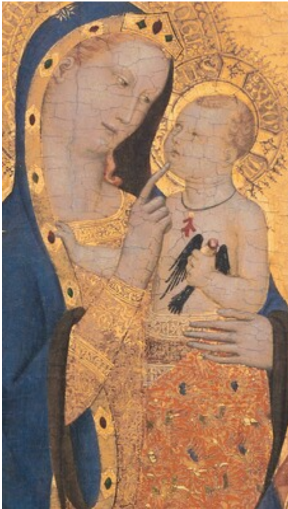
fig. 1 Detail of Madonna and Child (central panel), Puccio di Simone and Allegretto Nuzi, Madonna and Child Enthroned with Saints and Angels , 1354, tempera on panel, National Gallery of Art, Washington, Andrew W. Mellon Collection