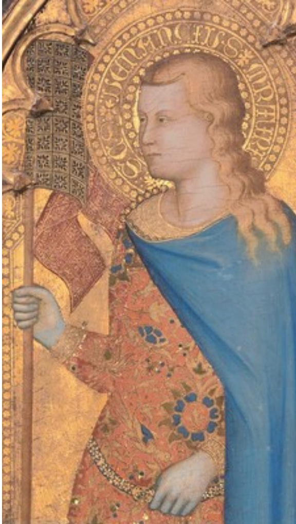
fig. 3 Detail of Saint Venantius (right panel), Puccio di Simone and Allegretto Nuzi, Madonna and Child Enthroned with Saints and Angels , 1354, tempera on panel, National Gallery of Art, Washington, Andrew W. Mellon Collection