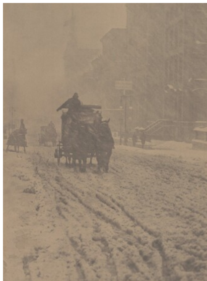
Alfred Stieglitz Winter—Fifth Avenue 1893, printed 1897 or later carbon print Key Set Number 84 same negative