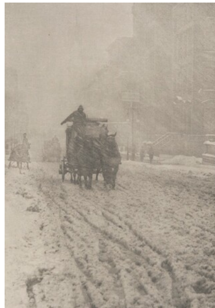
Alfred Stieglitz (editor/publisher) after Various Artists Alfred Stieglitz Winter—Fifth Avenue 1893, printed 1905 photogravure Key Set Number 85 same negative