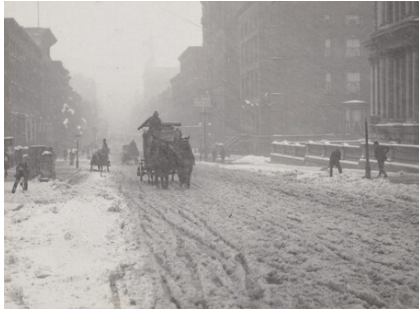
Alfred Stieglitz Winter on Fifth Avenue 1893, printed 1929/1932 gelatin silver print Key Set Number 86 same negative