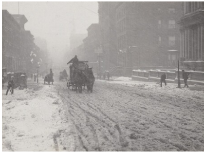
Alfred Stieglitz Winter on Fifth Avenue 1893, printed 1929/1932 gelatin silver print Key Set Number 86 same negative