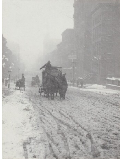
Alfred Stieglitz Winter on Fifth Avenue 1893, printed 1929/1932 gelatin silver print Key Set Number 87 same negative