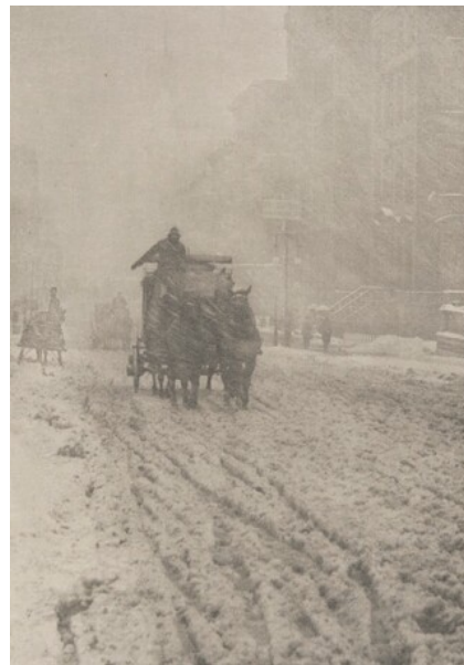
Alfred Stieglitz (editor/publisher) after Various Artists Alfred Stieglitz Winter—Fifth Avenue 1893, printed 1905 photogravure Key Set Number 85 same negative