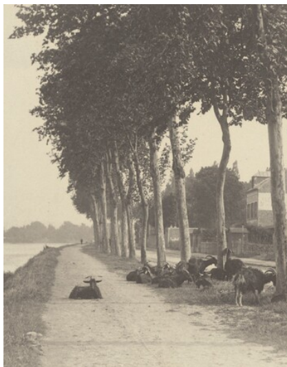
Alfred Stieglitz Homeward 1894, printed 1895/1896 platinum print Key Set Number 125