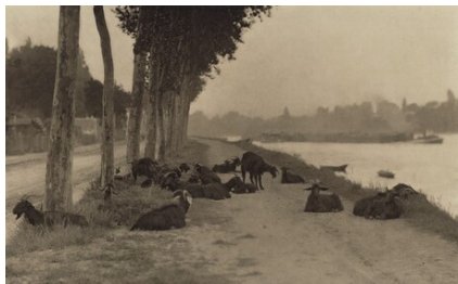
Alfred Stieglitz On the Seine—Near Paris 1894, printed 1897 photogravure Key Set Number 121