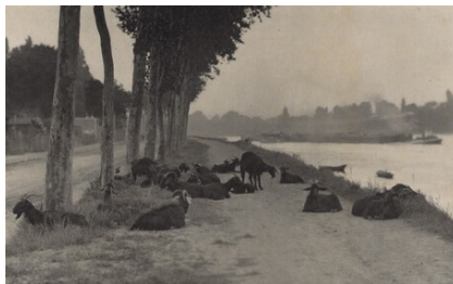
Alfred Stieglitz A Decorative Panel 1894, printed 1903/1904 photogravure Key Set Number 122