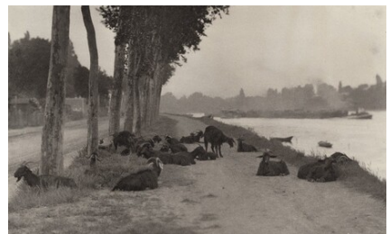
Alfred Stieglitz On the Seine—Near Paris 1894, printed 1897 photogravure Key Set Number 120