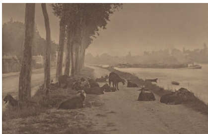
Alfred Stieglitz A Decorative Panel 1894 carbon print Key Set Number 118