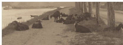
Alfred Stieglitz On the Seine 1894, printed 1895/1896 platinum print Key Set Number 119