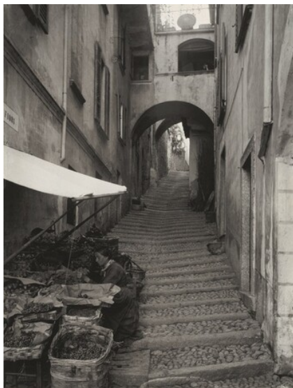
Alfred Stieglitz Via Fiori, Bellagio 1887, printed 1929/1934 gelatin silver print Key Set Number 36 same negative