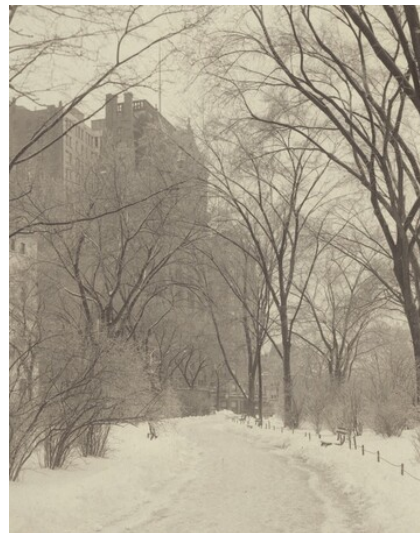
Alfred Stieglitz In the Park 1894, printed 1895/1896 platinum print Key Set Number 106