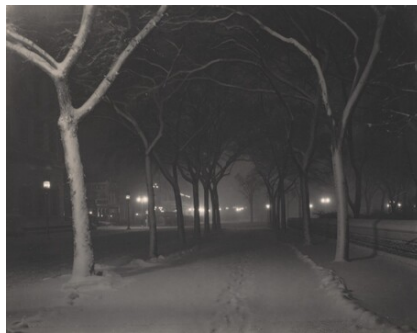
Alfred Stieglitz An Icy Night 1898, printed 1929/1932 gelatin silver print Key Set Number 259 same negative