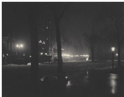
Alfred Stieglitz Night—Fifth Avenue probably 1898, printed 1929/1932 gelatin silver print Key Set Number 262