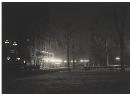
Alfred Stieglitz Night, New York probably 1898, printed 1929/1934 gelatin silver print Key Set Number 261