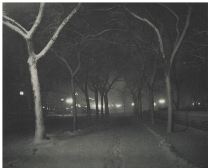
Alfred Stieglitz (editor/publisher) after Various Artists Alfred Stieglitz Icy Night (featured in ad for Goerz lenses) 1898, printed 1903 photogravure Key Set Number 258 same negative