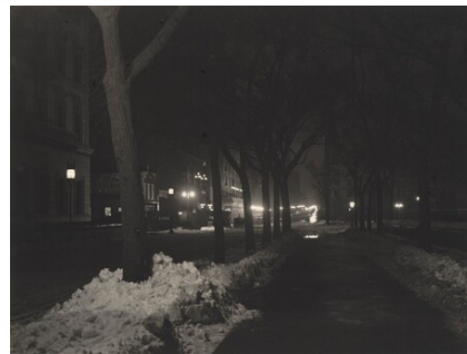
Alfred Stieglitz Night, New York 1898, printed 1929/1934 gelatin silver print Key Set Number 260