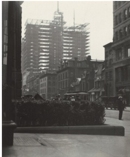
Alfred Stieglitz Old and New New York 1910, printed 1929/1934 gelatin silver print Key Set Number 346 same negative