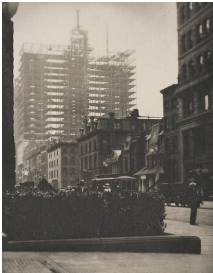
Alfred Stieglitz (editor/publisher) after Various Artists Alfred Stieglitz Old and New New York 1910, printed 1911 photogravure Key Set Number 344 same negative