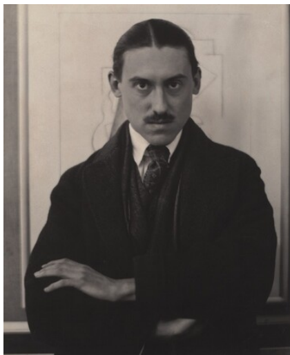
Alfred Stieglitz Charles Demuth 1915, printed 1924/1937 gelatin silver print Key Set Number 395 same negative