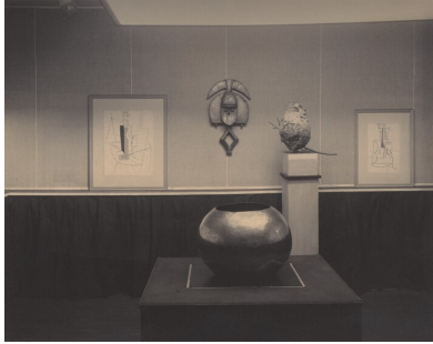
Alfred Stieglitz American, 1864 - 1946