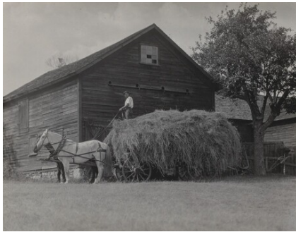
Alfred Stieglitz The Hay Wagon and Barn 1922 gelatin silver print Key Set Number 786