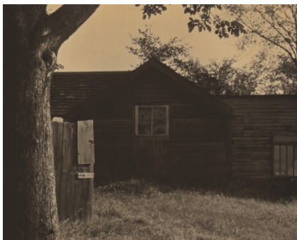
Alfred Stieglitz The Barn 1922 palladium print Key Set Number 783