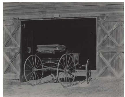
Alfred Stieglitz Barn and Carriage 1922 gelatin silver print Key Set Number 785