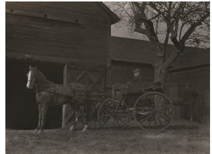
Alfred Stieglitz Horse and Carriage probably 1922 gelatin silver print Key Set Number 788