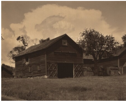
Alfred Stieglitz The Barn 1922 palladium print Key Set Number 780