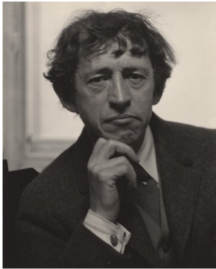
Alfred Stieglitz John Marin 1921/1922 gelatin silver print Key Set Number 707