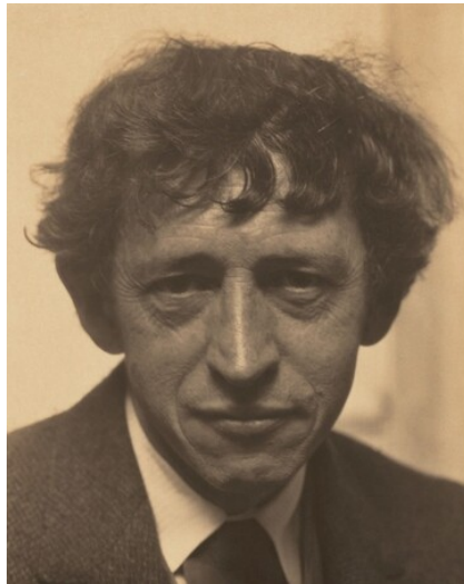
Alfred Stieglitz John Marin, the Water Colorist 1921/1922 palladium print Key Set Number 708