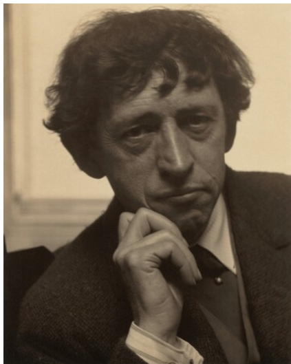
Alfred Stieglitz John Marin 1921/1922 palladium print Key Set Number 706