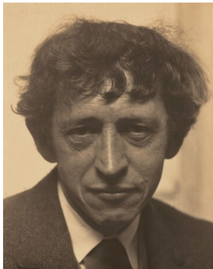
Alfred Stieglitz John Marin, the Water Colorist 1921/1922 palladium print Key Set Number 708