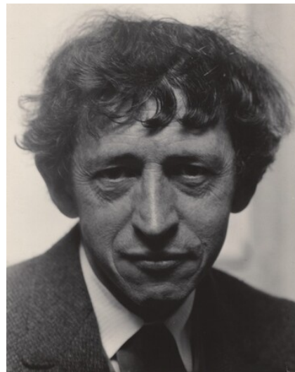
Alfred Stieglitz John Marin, the Water Colorist 1921/1922 gelatin silver print Key Set Number 709