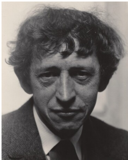
Alfred Stieglitz John Marin, the Water Colorist 1921/1922 gelatin silver print Key Set Number 709 same negative