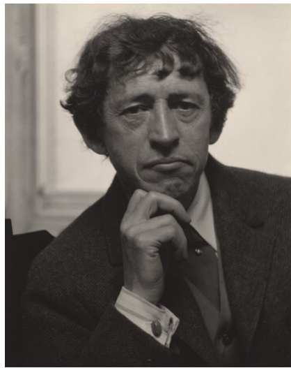
Alfred Stieglitz John Marin 1921/1922 gelatin silver print Key Set Number 707