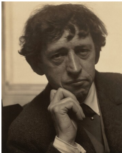
Alfred Stieglitz John Marin 1921/1922 palladium print Key Set Number 706