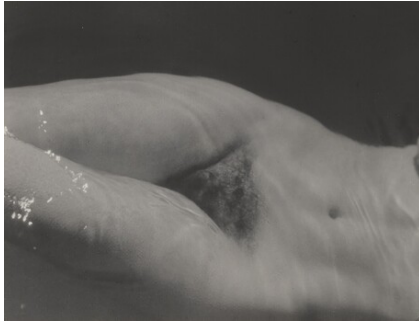
Alfred Stieglitz Rebecca Salsbury Strand 1922 gelatin silver print Key Set Number 753