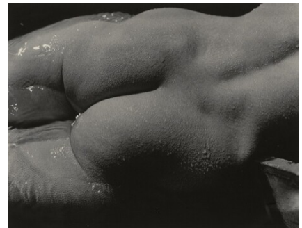
Alfred Stieglitz Rebecca Salsbury Strand 1922 gelatin silver print Key Set Number 759