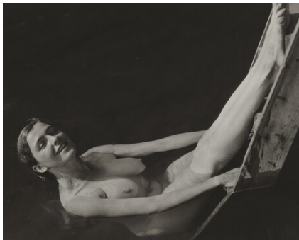
Alfred Stieglitz Rebecca Salisbury Strand 1922 gelatin silver print Key Set Number 750