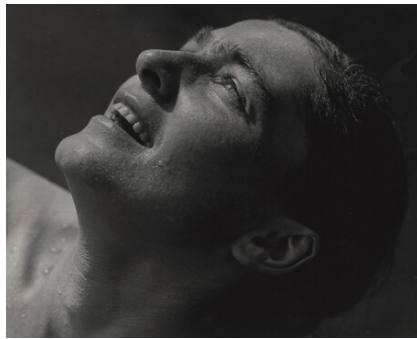
Alfred Stieglitz Rebecca Salisbury Strand 1922 gelatin silver print Key Set Number 752