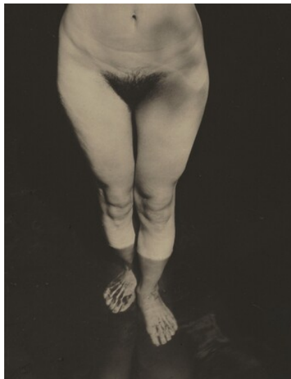
Alfred Stieglitz Rebecca Salsbury Strand 1922 gelatin silver print Key Set Number 761