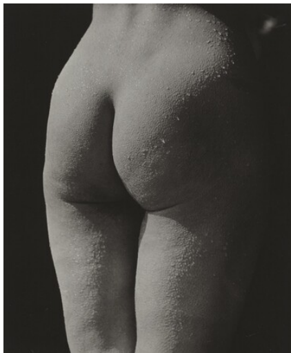
Alfred Stieglitz Rebecca Salsbury Strand 1922 gelatin silver print Key Set Number 760