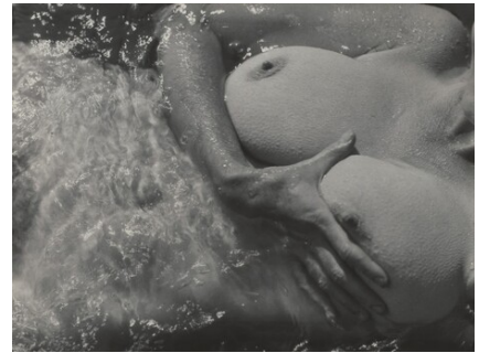
Alfred Stieglitz Rebecca Salsbury Strand 1922 gelatin silver print Key Set Number 756