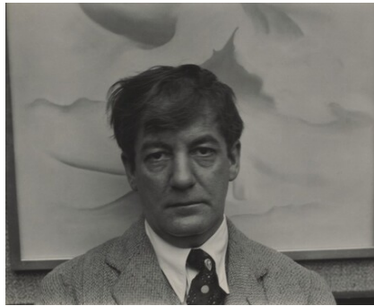
Alfred Stieglitz Sherwood Anderson 1923 gelatin silver print Key Set Number 851