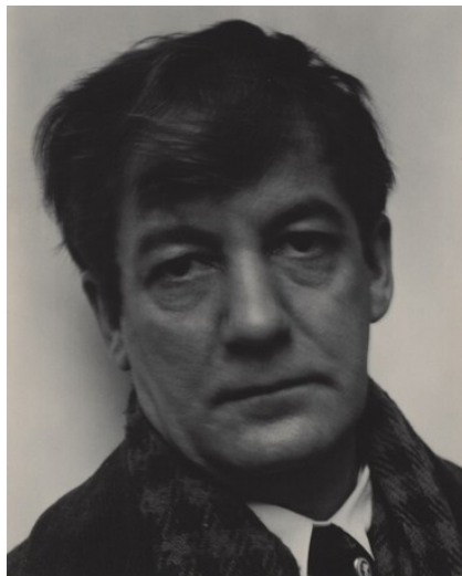
Alfred Stieglitz Sherwood Anderson 1923 gelatin silver print Key Set Number 848