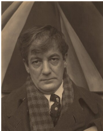
Alfred Stieglitz Sherwood Anderson 1923 palladium print Key Set Number 846