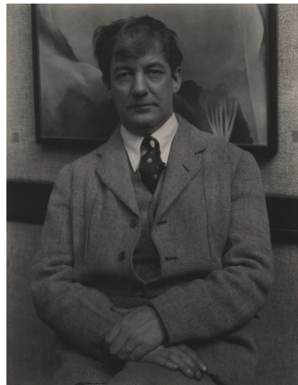
Alfred Stieglitz Sherwood Anderson 1923 gelatin silver print Key Set Number 849