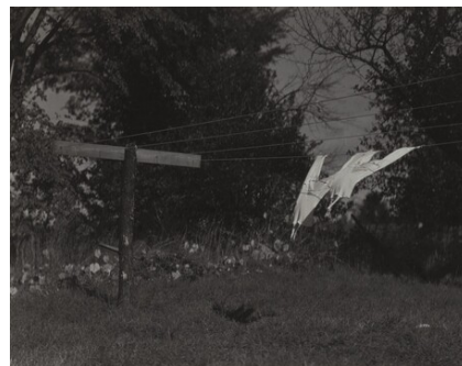
Alfred Stieglitz Long Underwear, Lake George 1924 gelatin silver print Key Set Number 1036