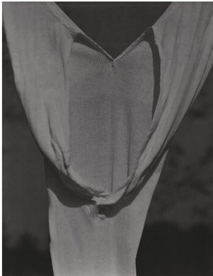
Alfred Stieglitz Long Underwear, Lake George 1924 gelatin silver print Key Set Number 1037