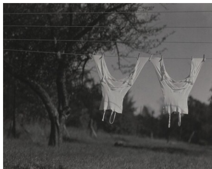
Alfred Stieglitz Long Underwear, Lake George 1924 gelatin silver print Key Set Number 1035