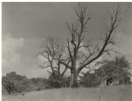
Alfred Stieglitz The Dying Chestnut Tree 1927 gelatin silver print Key Set Number 1195