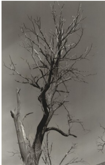
Alfred Stieglitz The Dying Chestnut Tree or Life and Death 1927 gelatin silver print Key Set Number 1193