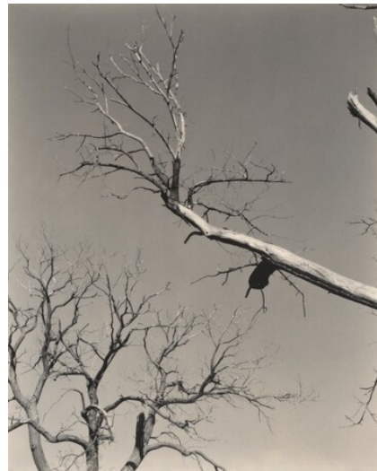
Alfred Stieglitz The Dying Chestnut Tree—My Teacher 1927 gelatin silver print Key Set Number 1194