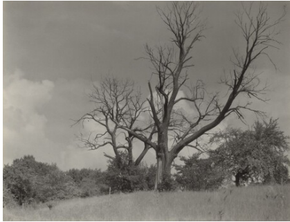
Alfred Stieglitz The Dying Chestnut Tree 1927 gelatin silver print Key Set Number 1195