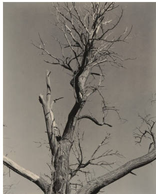
Alfred Stieglitz American, 1864 - 1946