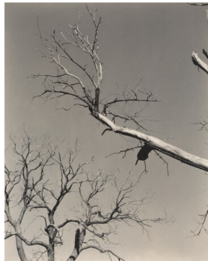
Alfred Stieglitz The Dying Chestnut Tree—My Teacher 1927 gelatin silver print Key Set Number 1194