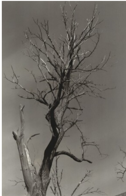
Alfred Stieglitz The Dying Chestnut Tree or Life and Death 1927 gelatin silver print Key Set Number 1193