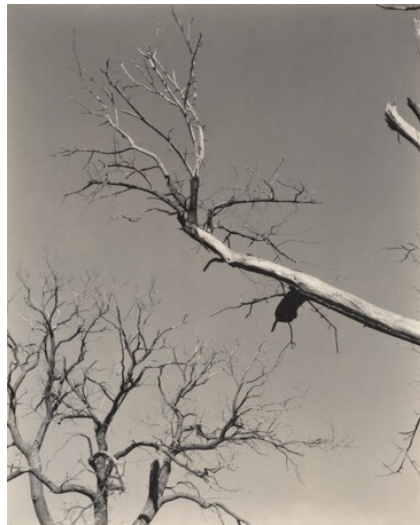
Alfred Stieglitz The Dying Chestnut Tree—My Teacher 1927 gelatin silver print Key Set Number 1194