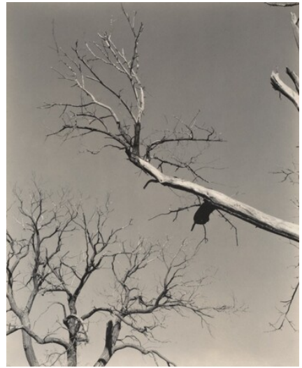
Alfred Stieglitz The Dying Chestnut Tree—My Teacher 1927 gelatin silver print Key Set Number 1194