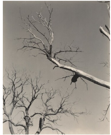
Alfred Stieglitz The Dying Chestnut Tree—My Teacher 1927 gelatin silver print Key Set Number 1194