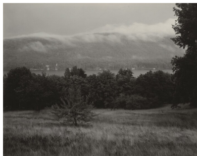
Alfred Stieglitz American, 1864 - 1946