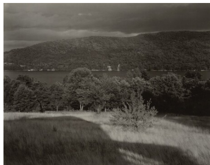
Alfred Stieglitz Lake George from the Hill 1932 gelatin silver print Key Set Number 1471