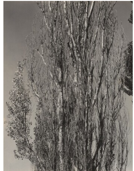
Alfred Stieglitz Poplars—Lake George 1932 gelatin silver print Key Set Number 1470