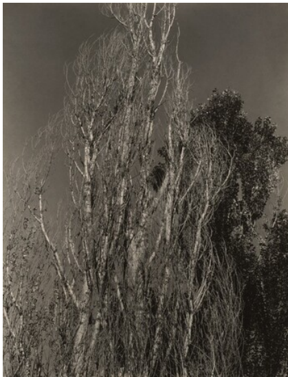
Alfred Stieglitz Poplars—Lake George 1932 gelatin silver print Key Set Number 1467