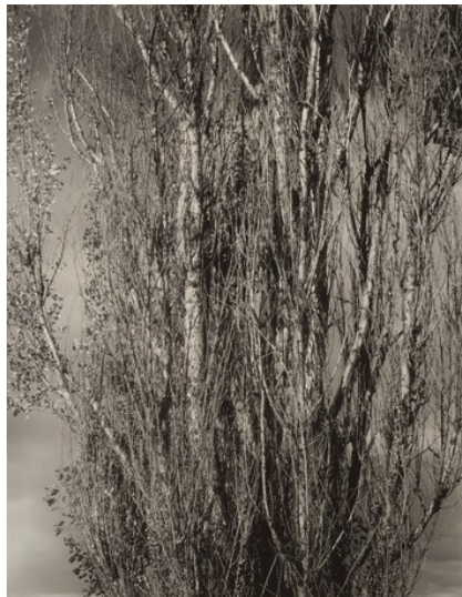
Alfred Stieglitz Dying Poplar and Live Branch—Lake George 1932 gelatin silver print Key Set Number 1469