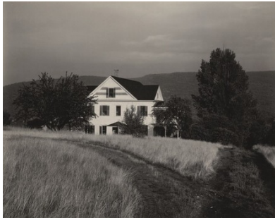
Alfred Stieglitz American, 1864 - 1946