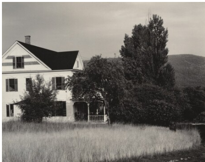
Alfred Stieglitz House and Trees, Lake George 1932 gelatin silver print Key Set Number 1466