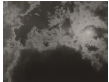
Alfred Stieglitz Songs of the Sky A4 1923 gelatin silver print Key Set Number 892