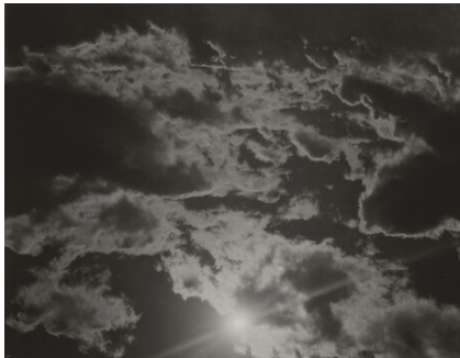
Alfred Stieglitz Songs of the Sky A8 1923 gelatin silver print Key Set Number 896