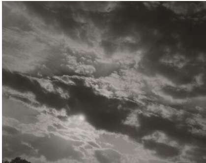
Alfred Stieglitz Songs of the Sky A2 1923 gelatin silver print Key Set Number 890