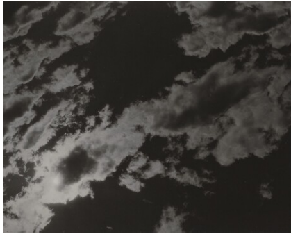
Alfred Stieglitz Songs of the Sky A5 1923 gelatin silver print Key Set Number 893