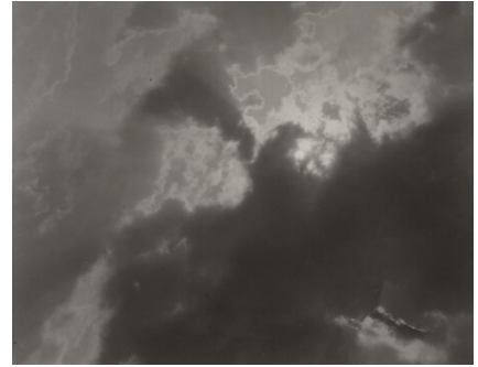
Alfred Stieglitz Songs of the Sky A7 1923 gelatin silver print Key Set Number 895