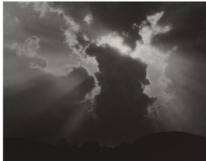
Alfred Stieglitz Songs of the Sky A9 1923 gelatin silver print Key Set Number 897