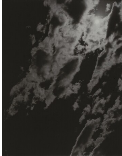
Alfred Stieglitz Songs of the Sky A6 1923 gelatin silver print Key Set Number 894