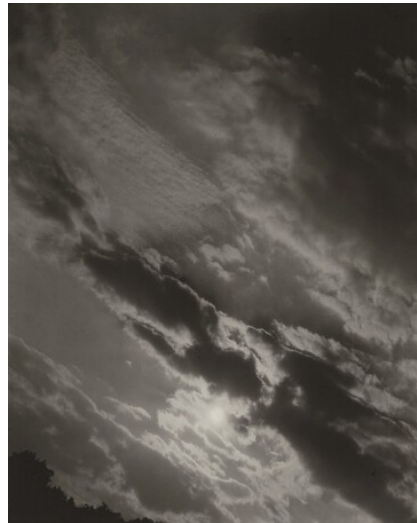
Alfred Stieglitz Songs of the Sky A3 1923 gelatin silver print Key Set Number 891