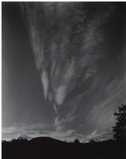
Alfred Stieglitz Lake George 1922/1923 gelatin silver print Key Set Number 804