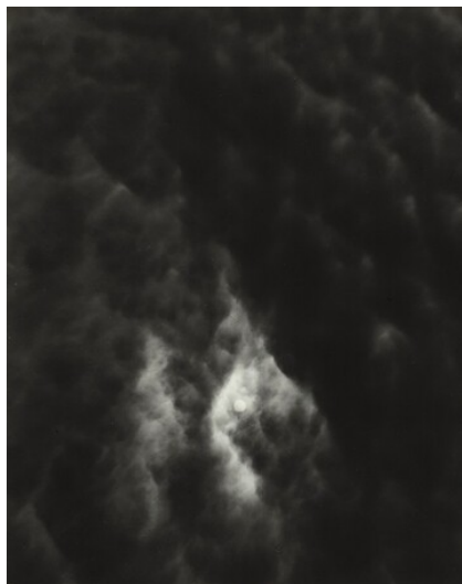
Alfred Stieglitz Equivalent, Set C2 No. 2 1929 gelatin silver print Key Set Number 1254