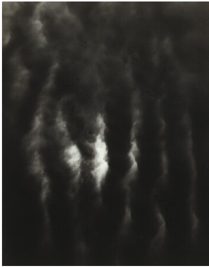
Alfred Stieglitz Equivalent, Set C2 No. 5 1929 gelatin silver print Key Set Number 1257

For information about the date of this photograph, see Key Set number 1253.