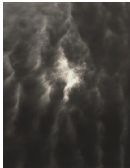
Alfred Stieglitz Equivalent, Set C2 No. 4 1929 gelatin silver print Key Set Number 1256