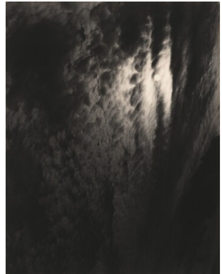
Alfred Stieglitz Equivalent, Series XX No. 3 1929 gelatin silver print Key Set Number 1286