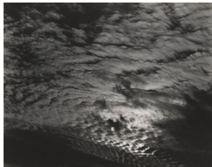
Alfred Stieglitz Equivalent, Series XX No. 6 1929 gelatin silver print Key Set Number 1289