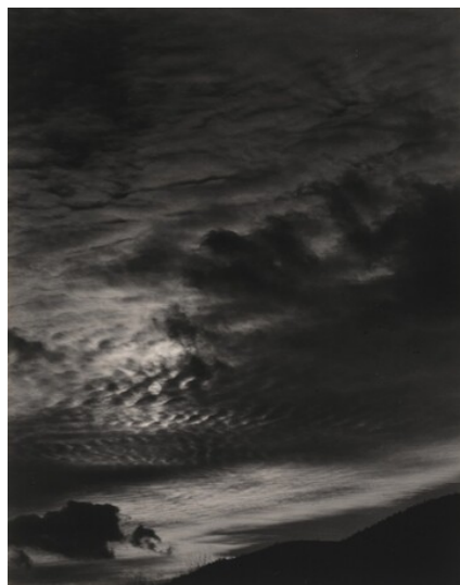
Alfred Stieglitz Equivalent, Series XX No. 1 1929 gelatin silver print Key Set Number 1284