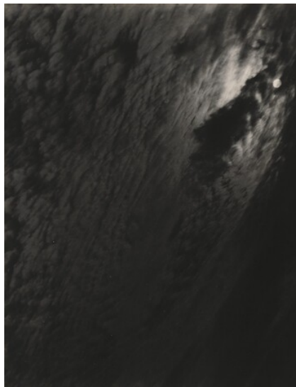
Alfred Stieglitz Equivalent, Series XX No. 5 1929 gelatin silver print Key Set Number 1288