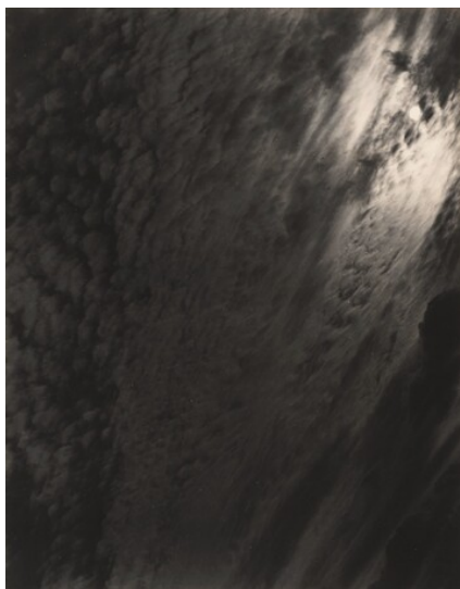
Alfred Stieglitz Equivalent, Series XX No. 7 1929 gelatin silver print Key Set Number 1290