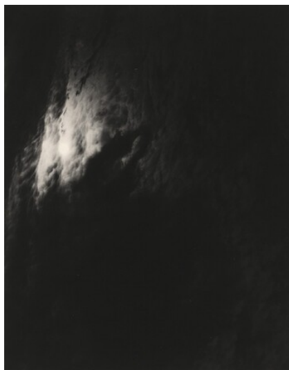
Alfred Stieglitz Equivalent, Series XX No. 8 1929 gelatin silver print Key Set Number 1291