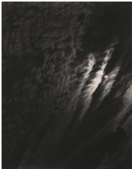
Alfred Stieglitz Equivalent, Series XX No. 4 1929 gelatin silver print Key Set Number 1287