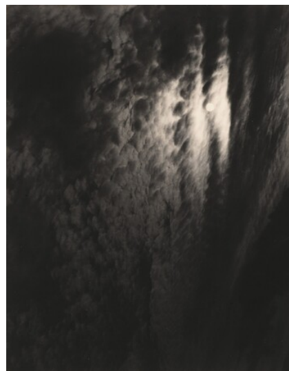
Alfred Stieglitz Equivalent, Series XX No. 3 1929 gelatin silver print Key Set Number 1286