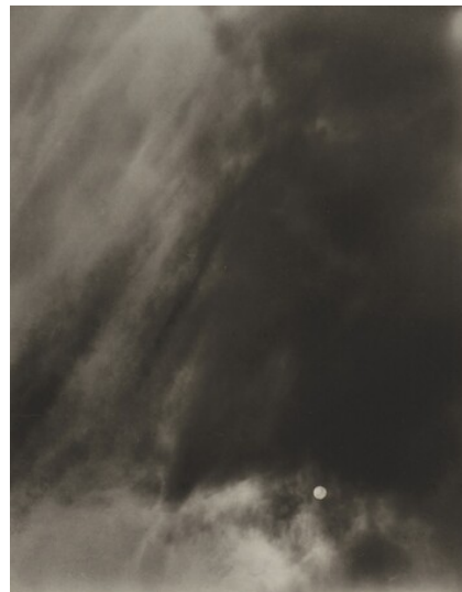
Alfred Stieglitz Equivalent 1925/1927 gelatin silver print Key Set Number 1131