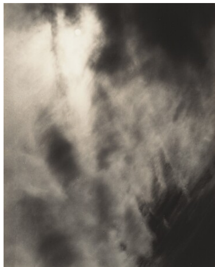
Alfred Stieglitz Equivalent 1925/1927 gelatin silver print Key Set Number 1129