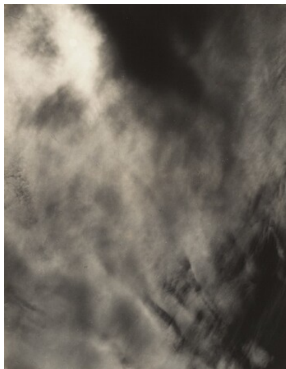
Alfred Stieglitz Equivalent 1925/1927 gelatin silver print Key Set Number 1130