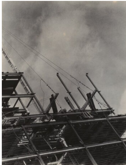
Alfred Stieglitz From My Window at the Shelton, North 1930 gelatin silver print Key Set Number 1354