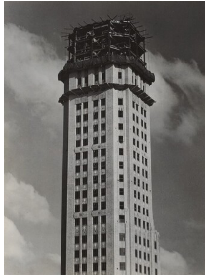
Alfred Stieglitz From My Window at the Shelton, North 1930/1931 gelatin silver print Key Set Number 1356