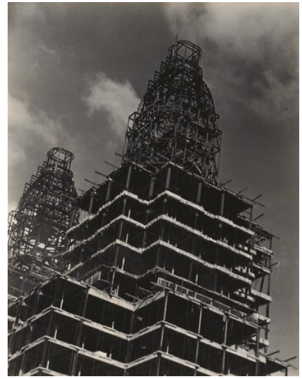
Alfred Stieglitz From My Window at the Shelton, North 1930 gelatin silver print Key Set Number 1352