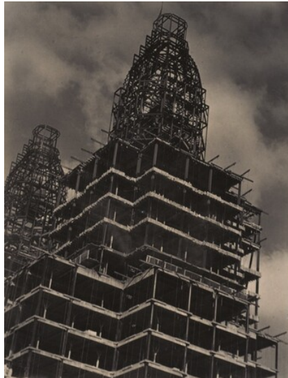
Alfred Stieglitz From My Window at the Shelton, North 1930 gelatin silver print Key Set Number 1351