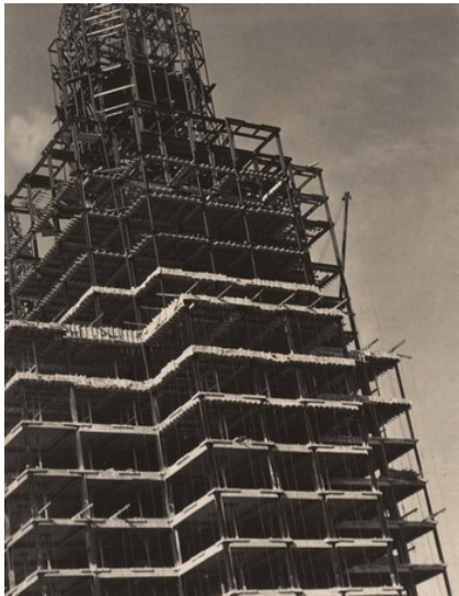
Alfred Stieglitz From My Window at the Shelton, North 1930 gelatin silver print Key Set Number 1350