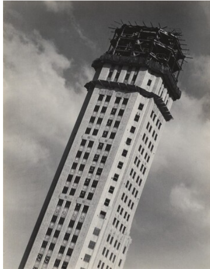
Alfred Stieglitz From My Window at the Shelton, North 1930/1931 gelatin silver print Key Set Number 1355