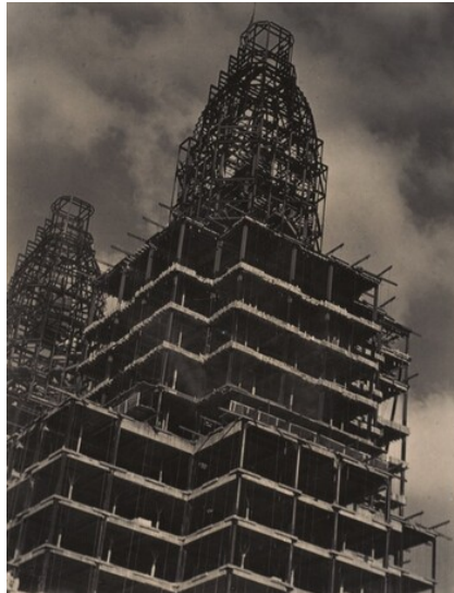
Alfred Stieglitz From My Window at the Shelton, North 1930 gelatin silver print Key Set Number 1351