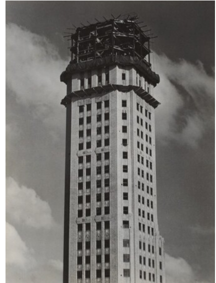
Alfred Stieglitz From My Window at the Shelton, North 1930/1931 gelatin silver print Key Set Number 1356