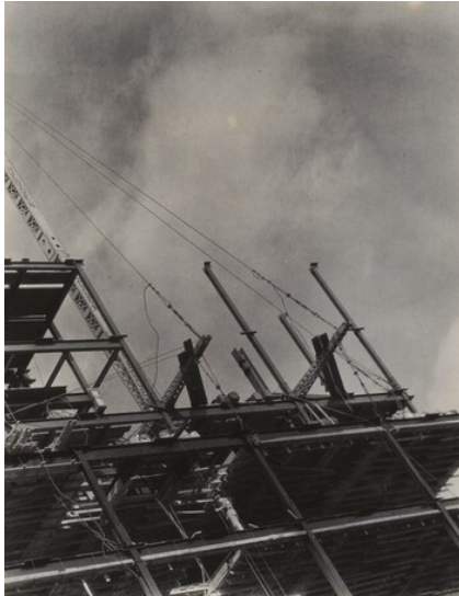
Alfred Stieglitz From My Window at the Shelton, North 1930 gelatin silver print Key Set Number 1354