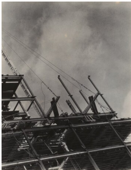
Alfred Stieglitz From My Window at the Shelton, North 1930 gelatin silver print Key Set Number 1354