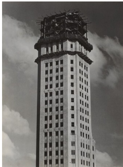
Alfred Stieglitz From My Window at the Shelton, North 1930/1931 gelatin silver print Key Set Number 1356