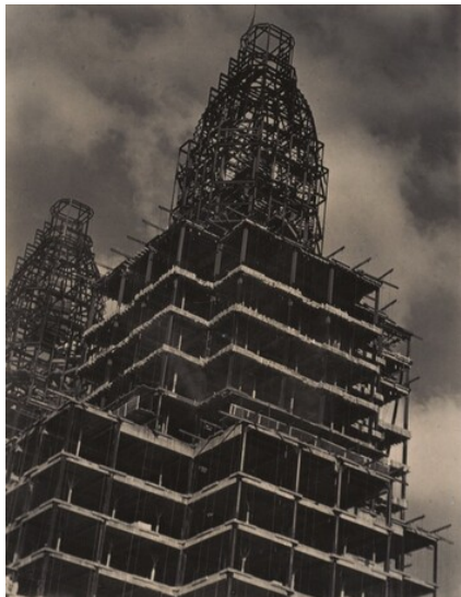
Alfred Stieglitz From My Window at the Shelton, North 1930 gelatin silver print Key Set Number 1351