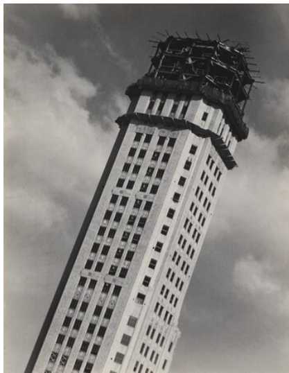
Alfred Stieglitz From My Window at the Shelton, North 1930/1931 gelatin silver print Key Set Number 1355