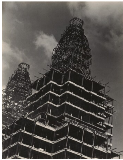
Alfred Stieglitz From My Window at the Shelton, North 1930 gelatin silver print Key Set Number 1352