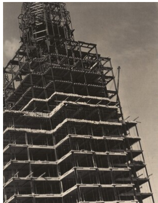
Alfred Stieglitz American, 1864 - 1946