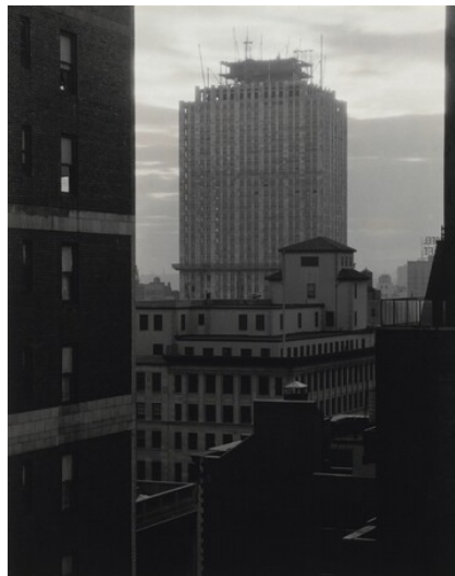
Alfred Stieglitz From My Window at An American Place, Southwest April 1932 gelatin silver print Key Set Number 1458