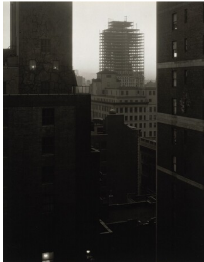
Alfred Stieglitz From My Window at An American Place, Southwest March 1932 gelatin silver print Key Set Number 1453