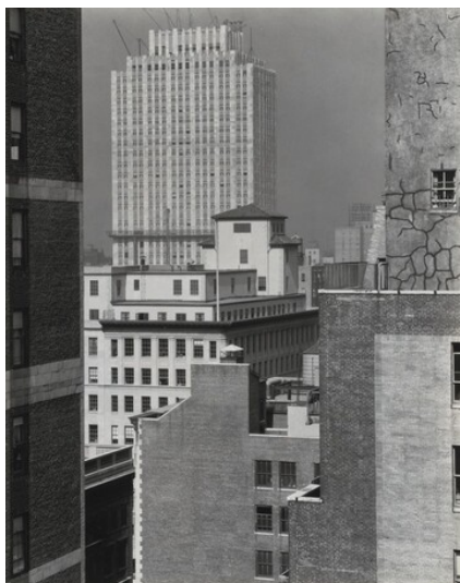
Alfred Stieglitz From My Window at An American Place, Southwest April/June 1932 gelatin silver print Key Set Number 1459