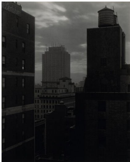
Alfred Stieglitz From My Window at An American Place, Southwest April/June 1932 gelatin silver print Key Set Number 1462