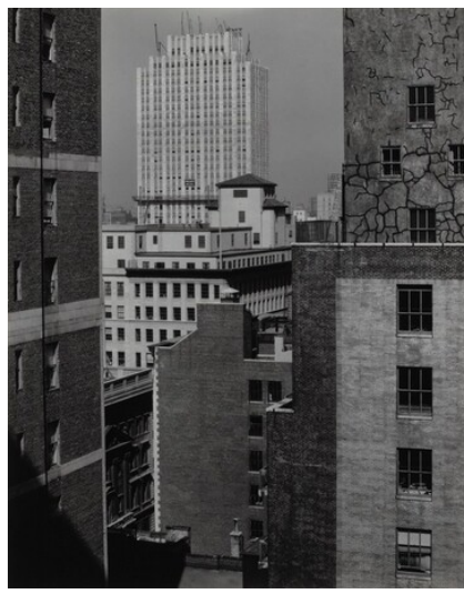
Alfred Stieglitz From My Window at An American Place, Southwest April/June 1932 gelatin silver print Key Set Number 1461