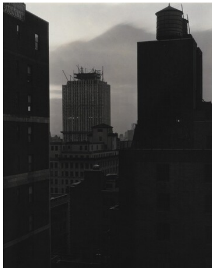
Alfred Stieglitz From My Window at An American Place, Southwest April 1932 gelatin silver print Key Set Number 1457