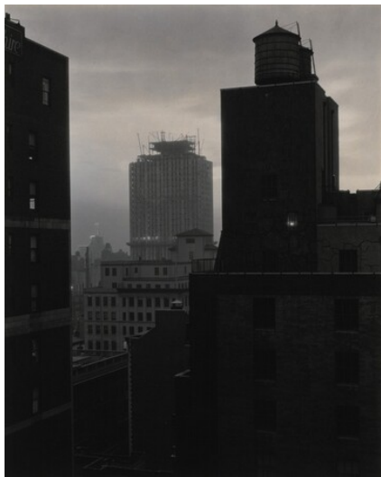
Alfred Stieglitz From My Window at An American Place, Southwest 1932 gelatin silver print Key Set Number 1456