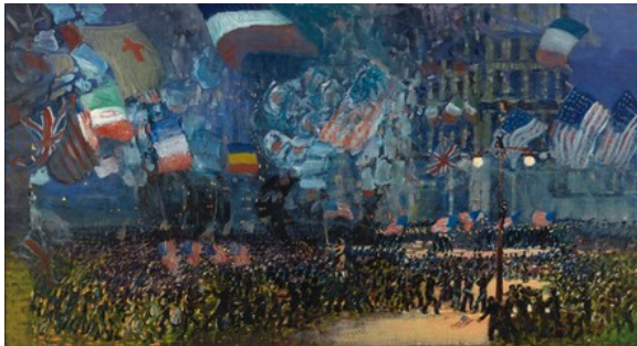
fig. 3 George Luks, Armistice Night , 1918, oil on canvas, Whitney Museum of American Art, New York, gift of an anonymous donor, 54.58