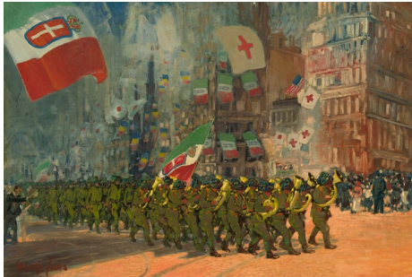
George Luks American, 1866 - 1933