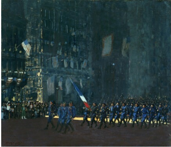
fig. 1 George Luks, Blue Devils on Fifth Avenue , 1918, oil on canvas, The Phillips Collection, Washington, DC, acquired 1918