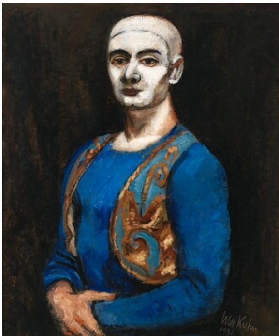
fig. 3 Walt Kuhn, The Blue Clown , 1931, oil on canvas, Whitney Museum of American Art, New York; purchase 31.182