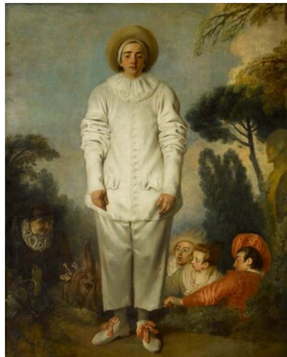
fig. 2 Jean-Antoine Watteau, Pierrot , formerly known as Gilles , c. 1718–1719, oil on canvas, Musée du Louvre, Paris.