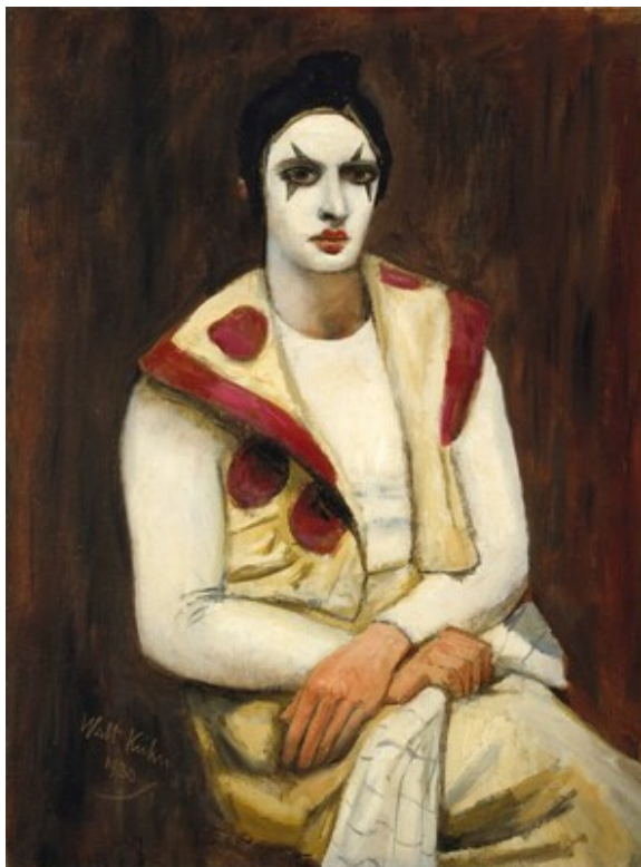
fig. 1 Walt Kuhn, Clown with Black Wig , 1930, oil on canvas, The Metropolitan Museum of Art, New York. George A. Hearn Fund, 1956. © The Metropolitan Museum of Art. Image: Art Resource, NY