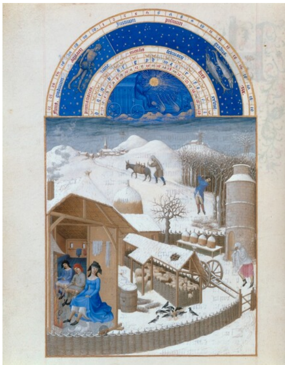
fig. 1 Limbourg Brothers, February calendar page from the Très Riches Heures du Duc de Berry (MS 65, fol. 2v), c. 1415, gouache on vellum, Musée Condé, Chantilly.