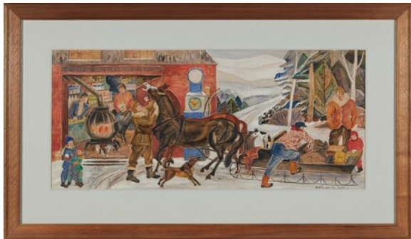
fig. 3 Marguerite Zorach, Winter Supplies , 1937, gouache, Courtesy of the Fine Arts Collection, U.S. General Services Administration. Commissioned through the Section of Fine Arts, 1934–1943.