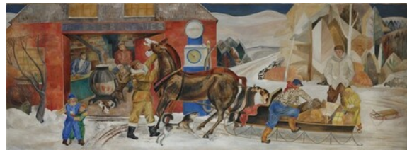
fig. 4 Marguerite Zorach, New Hampshire Post Office in Winter , 1937, mural, United States Post Office, Peterborough, New Hampshire.