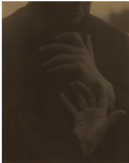
Alfred Stieglitz Georgia O'Keeffe—Hands 1918 palladium print Key Set Number 540