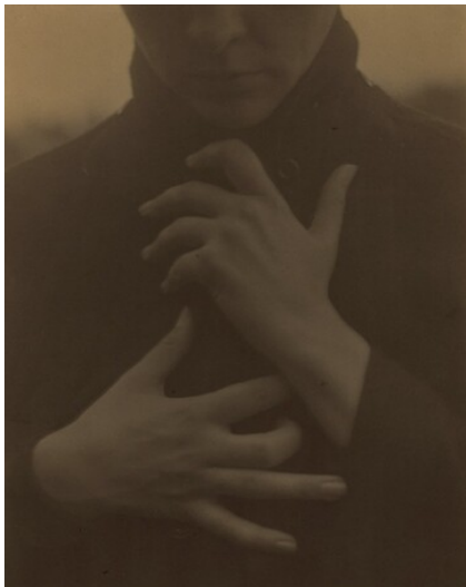
Alfred Stieglitz Georgia O'Keeffe—Hands 1918 palladium print Key Set Number 538