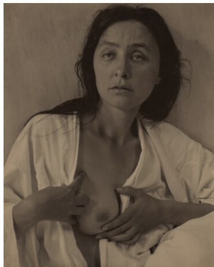
Alfred Stieglitz Georgia O'Keeffe 1918 palladium print Key Set Number 500