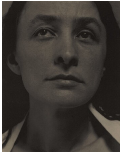
Alfred Stieglitz Georgia O'Keeffe 1918 palladium print Key Set Number 504

A corresponding print was given to the following institution(s) by Alfred Stieglitz during his lifetime, or was received or acquired from the estate: