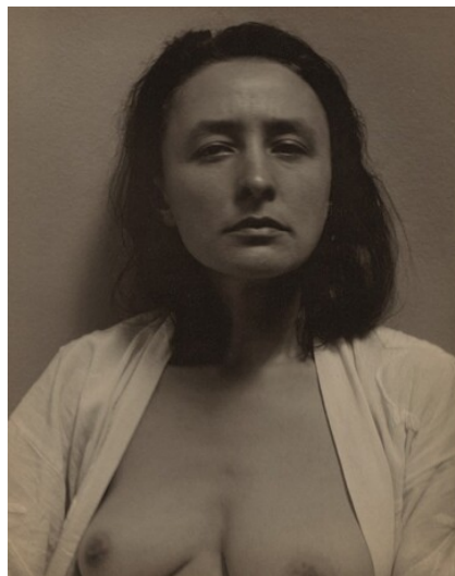
Alfred Stieglitz Georgia O'Keeffe 1918 palladium print Key Set Number 502