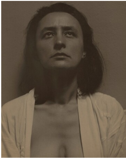
Alfred Stieglitz Georgia O'Keeffe 1918 palladium print Key Set Number 503