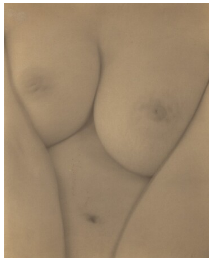
Alfred Stieglitz Georgia O'Keeffe—Breasts 1919 palladium print Key Set Number 577