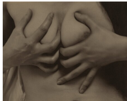
Alfred Stieglitz Georgia O'Keeffe—Hands and Breasts 1919 palladium print Key Set Number 580