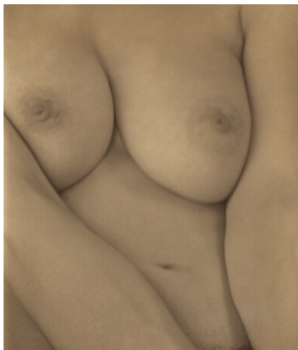
Alfred Stieglitz Georgia O'Keeffe—Breasts 1919 palladium print Key Set Number 574 same negative