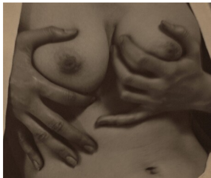
Alfred Stieglitz Georgia O'Keeffe—Hands and Breasts 1919 palladium print Key Set Number 579