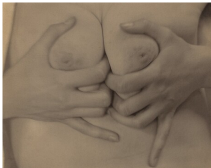
Alfred Stieglitz Georgia O'Keeffe—Hands and Breasts 1919 palladium print Key Set Number 578