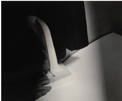
Alfred Stieglitz Georgia O'Keeffe—Feet 1919, printed 1924/1937 gelatin silver print Key Set Number 591