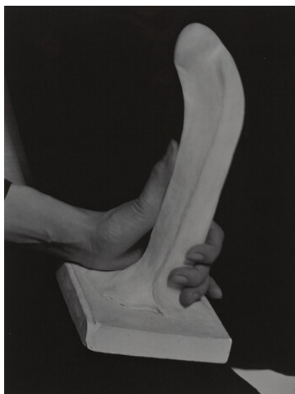
Alfred Stieglitz Georgia O'Keeffe—Hand 1919, printed 1924/1937 gelatin silver print Key Set Number 589