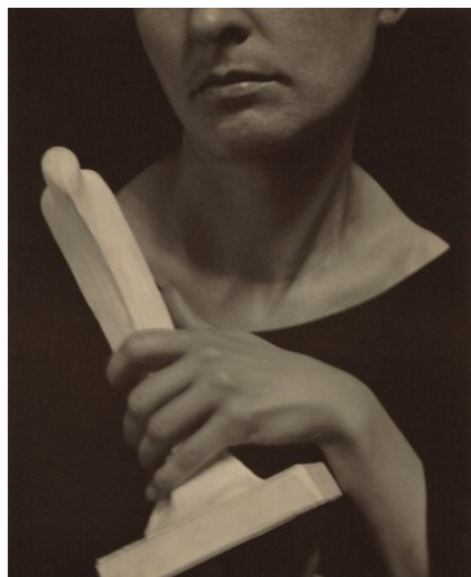
Alfred Stieglitz Georgia O'Keeffe 1919 palladium print Key Set Number 584