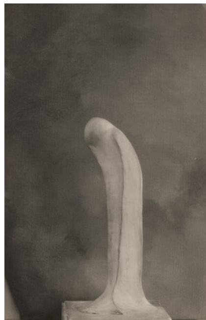
Alfred Stieglitz Interpretation 1919 gelatin silver print Key Set Number 587