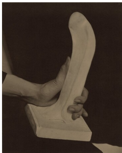
Alfred Stieglitz Georgia O'Keeffe—Hand 1919 palladium print Key Set Number 588