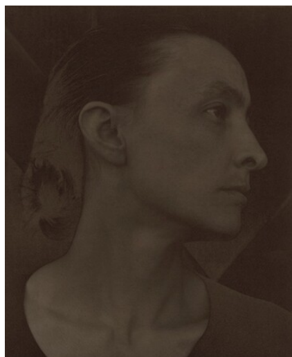
Alfred Stieglitz Georgia O'Keeffe 1921 palladium print Key Set Number 673 same negative