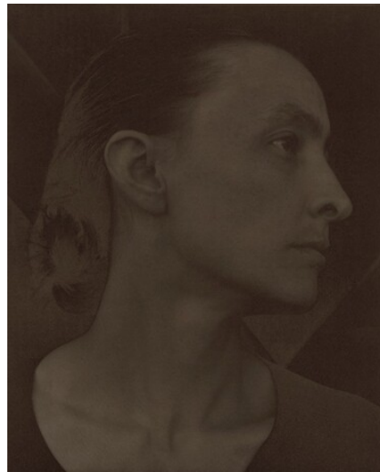
Alfred Stieglitz Georgia O'Keeffe 1921 palladium print Key Set Number 673