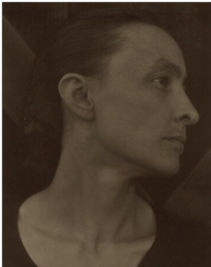
Alfred Stieglitz Georgia O'Keeffe 1921 palladium print Key Set Number 672