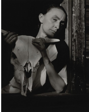
Alfred Stieglitz American, 1864 - 1946