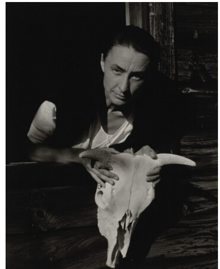
Alfred Stieglitz Georgia O'Keeffe 1931 gelatin silver print Key Set Number 1432