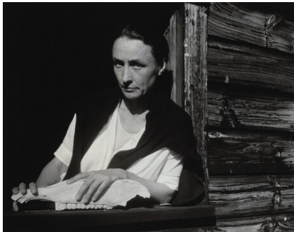
Alfred Stieglitz Georgia O'Keeffe 1931 gelatin silver print Key Set Number 1430