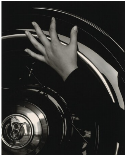
Alfred Stieglitz Georgia O'Keeffe—Hand and Wheel 1933 gelatin silver print Key Set Number 1515