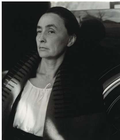
Alfred Stieglitz Georgia O'Keeffe 1933 gelatin silver print Key Set Number 1520