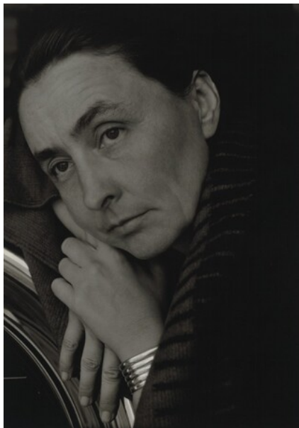
Alfred Stieglitz Georgia O'Keeffe 1933 gelatin silver print Key Set Number 1518