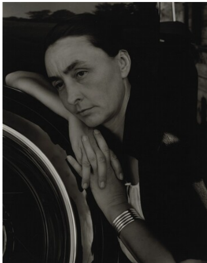
Alfred Stieglitz Georgia O'Keeffe 1933 gelatin silver print Key Set Number 1516