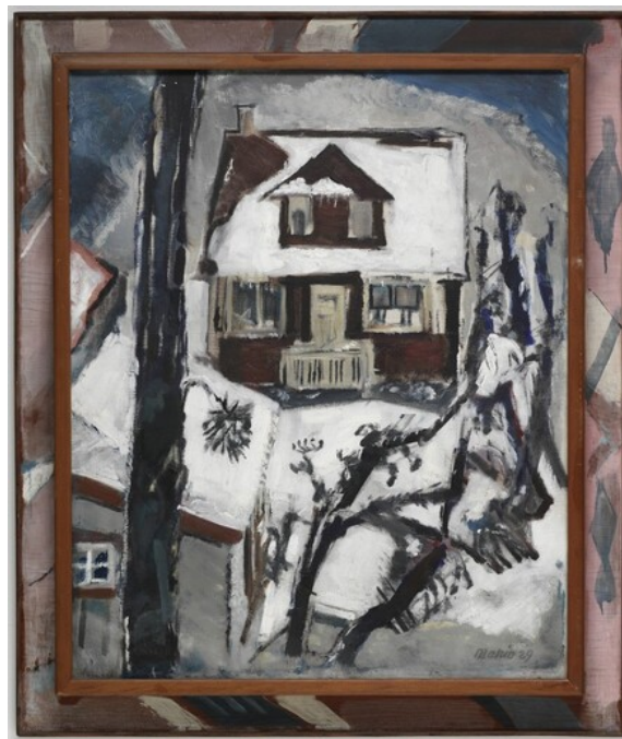
fig. 2 John Marin, From My Window, Cliffside, New Jersey, 1929, oil on canvas, Detroit Institute of Arts, Bequest of Robert H. Tannahill.