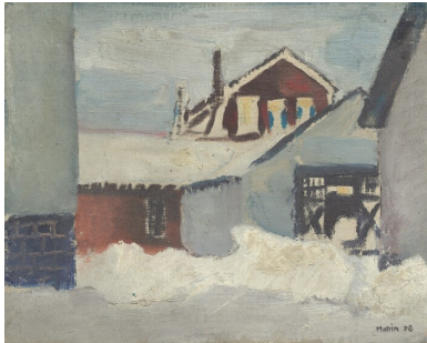
John Marin American, 1870 - 1953