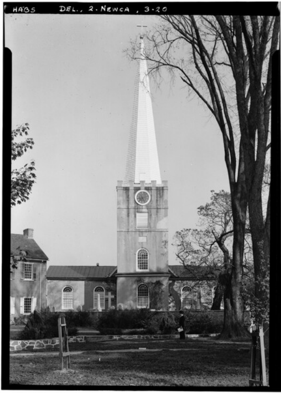
fig. 1 W. S. Stewart, West Facade—Immanuel Church (Episcopal), The Green, New Castle, New Castle County, DE , October 23, 1936, photograph, Library of Congress, Prints and Photographs Division, Washington, DC