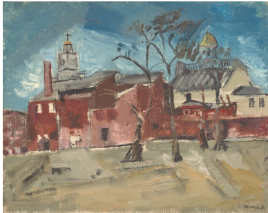
John Marin American, 1870 - 1953