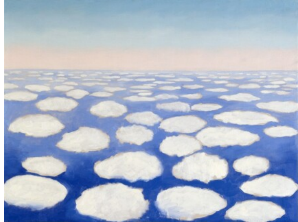
fig. 2 Georgia O'Keeffe, Above the Clouds I, 1962–1963, oil on canvas, Georgia O'Keeffe Museum, Santa Fe, NM, Gift of The Burnett Foundation and The Georgia O'Keeffe Foundation, 1997.5.14.