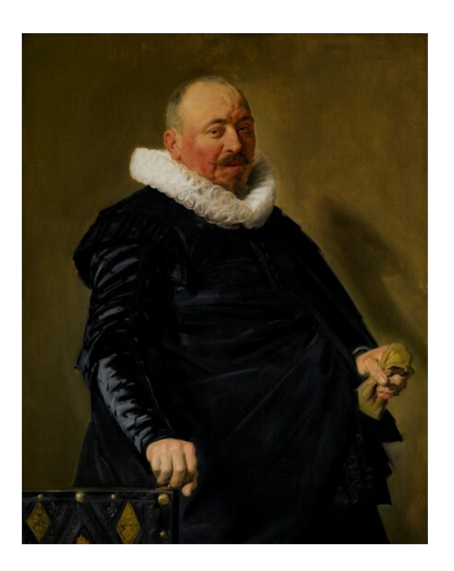
fig. 3 Frans Hals, Portrait of a Man , c. 1633, oil on canvas, Frick Collection, New York

Dutch Paintings of the Seventeenth Century