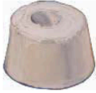
Angel Food Cake